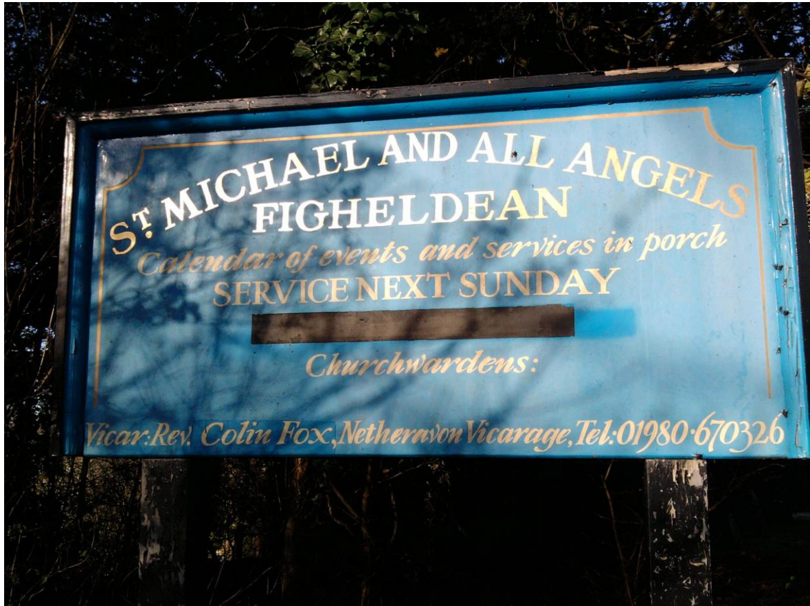
St. Michael and All Angels Church, Figheldean