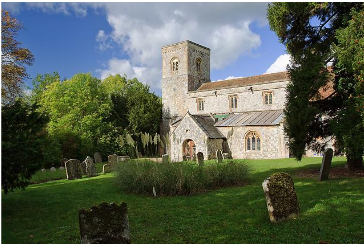
St. Michael and All Angels Church, Figcheldean

St. Michael and All Angels Churchyard, Figcheldean contains 17 Commonwealth War Graves – 16 from World War 1 & 1 from World War 2.