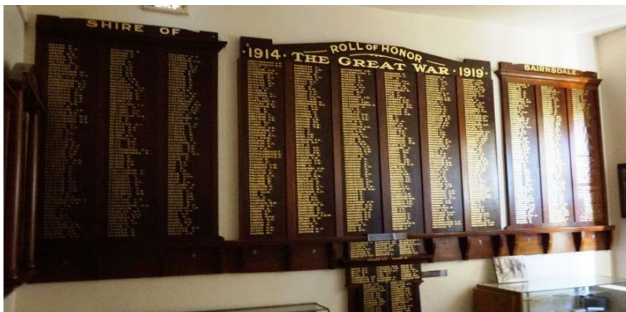
Shire of Bairnsdale Roll of Honour