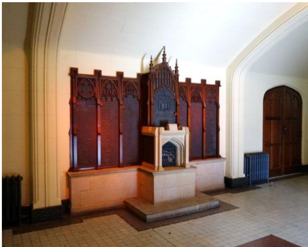
Melbourne Grammar School Honour Roll