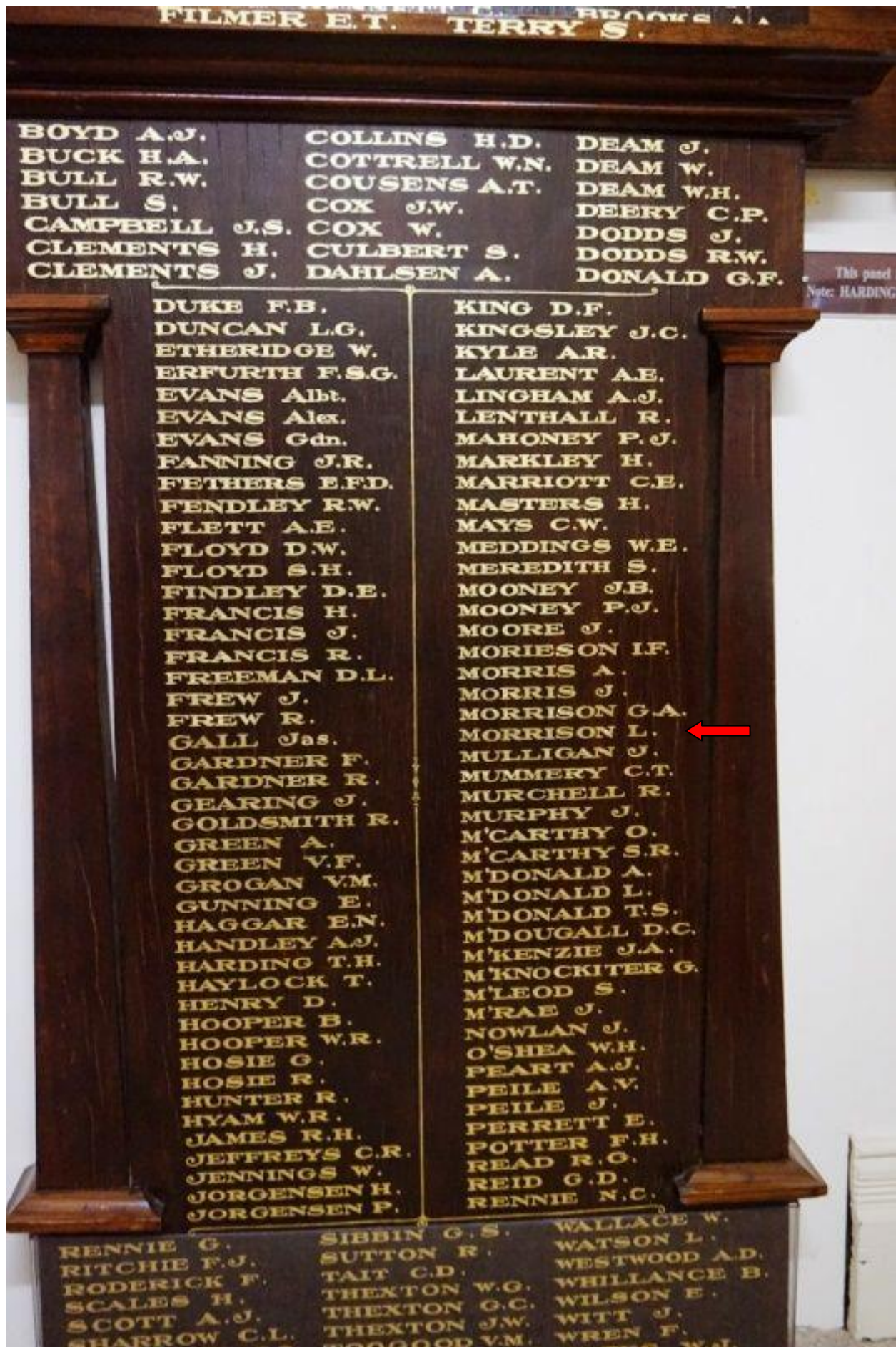
Shire of Bairnsdale Roll of Honour